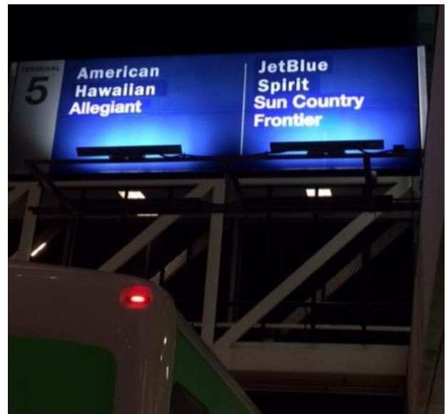
Overhead signs were updated each night as more than a dozen airlines changed terminals in mid-May.

There was a flurry of activity May 12-17 as 21 airlines at LAX relocated terminals or ticket counters, and a total of 28 involved by the end of June. When XL Airways France resumes seasonal service on Sunday, June 4, it will operate out of Terminal 6, while Thomas Cook Airlines will relocate its operations from the Tom Bradley International Terminal (TBIT) to Terminal 6 later this month. The easiest way to determine which terminal your flight is departing from is to check in online and print or download boarding passes before arriving at LAX; the gate numbers correspond to the terminals, with Gates 21-28 located in Terminal 2, Gates 30-39 in Terminal 3 and so on. Gates numbered in the 100s are in TBIT, which is often listed as Terminal B.