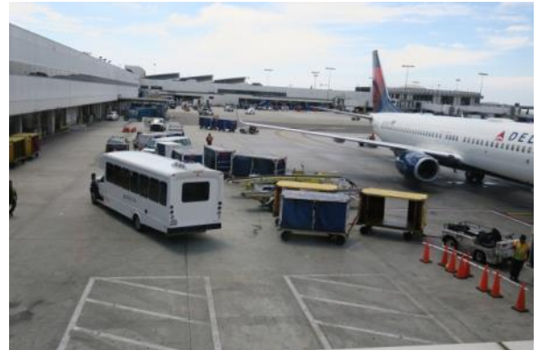
Delta Air Lines has shuttle buses connecting passengers from Terminal 2 (at Gate 22A) to Terminal 3 (Gate 35) and Terminal B.