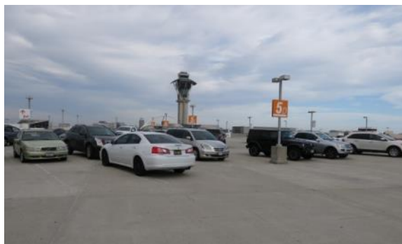
The top level of Parking Structure 3 is closed for waterproofing until early July.