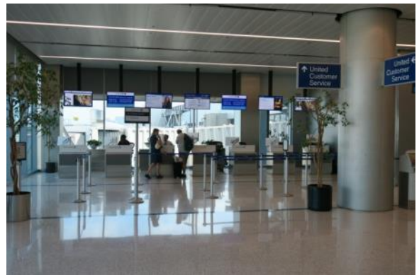
United Airlines' customer service counter is in a new location between Terminals 7 and 8.

expected to return to service in June. Gate 84 is temporarily closed, with Gate 76 closing for renovation later in June. A new men's restroom has opened between Gates 72 and 74 while the women's restroom between Gates 75A and 75B is closed for renovation. A new pair of escalators leads passengers from the concourse to baggage claim. The old escalators will be removed. A new Baggage Carousel 1 has opened with United Baggage Service office temporarily located near the new restrooms on the west end of the baggage claim area. Construction barricades have been installed around Baggage Carousel 2, which is being replaced, with work scheduled until late December. The bridge from Parking Structure 7 is closed for elevator demolition and construction, but expected to reopen at the end of June. Access to the parking structure is available on the Lower/Arrivals Level.