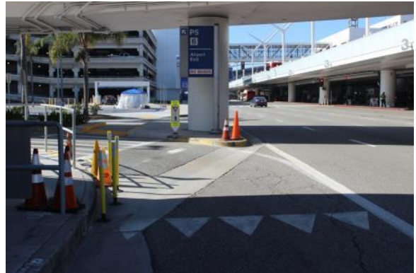
West Way will be closed at World Way North, between Parking Structures 2B and 3, for several weeks due to a widening project.