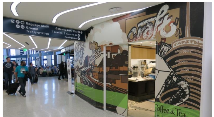
Peet's Coffee will open on the concourse near the escalators to the tunnel in Terminal 6 this month.