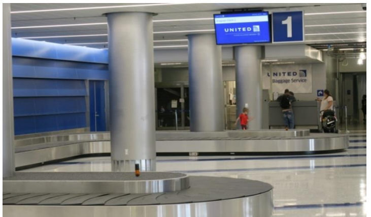
A new baggage carousel is scheduled to open later this month in Terminal 7.

end of the baggage claim area. The bridge from Parking Structure 7 is closed through May for elevator demolition and construction. Access to the parking structure is available on the