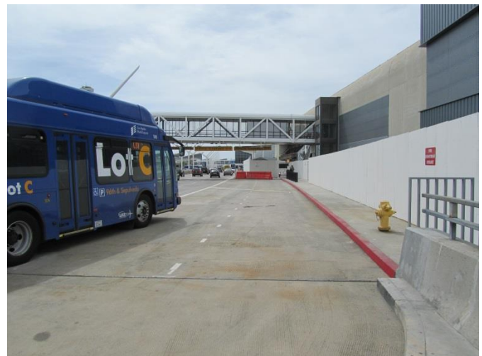
A pickup and drop-off area for parking shuttles and Lot C buses opened in mid-April on the Upper/Departures Level