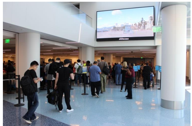
A new Security Screening Check Point area opened in Terminal 1 in early April.