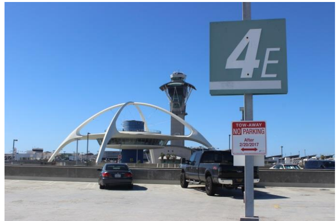
The roof of Parking Structure 1 will be closed until mid-April for waterproofing work.