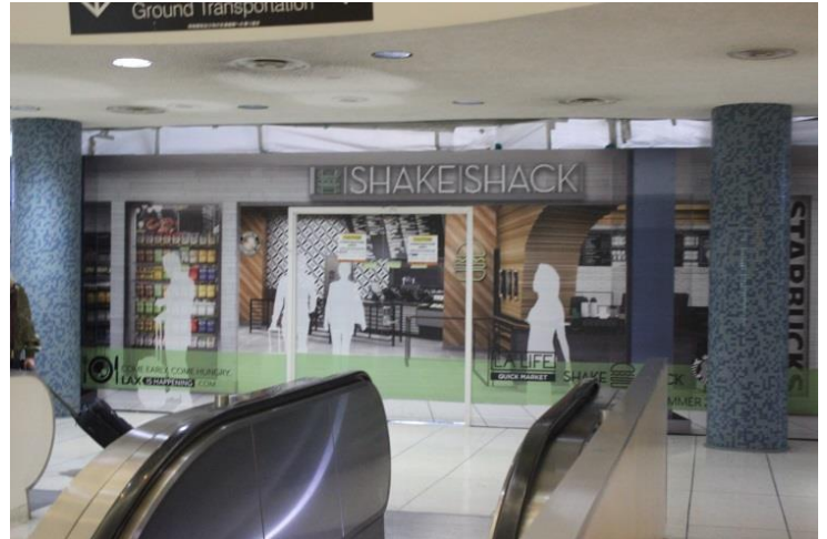
New concessions, including Shake Shack, are slated to open in Terminal 3 later this year.