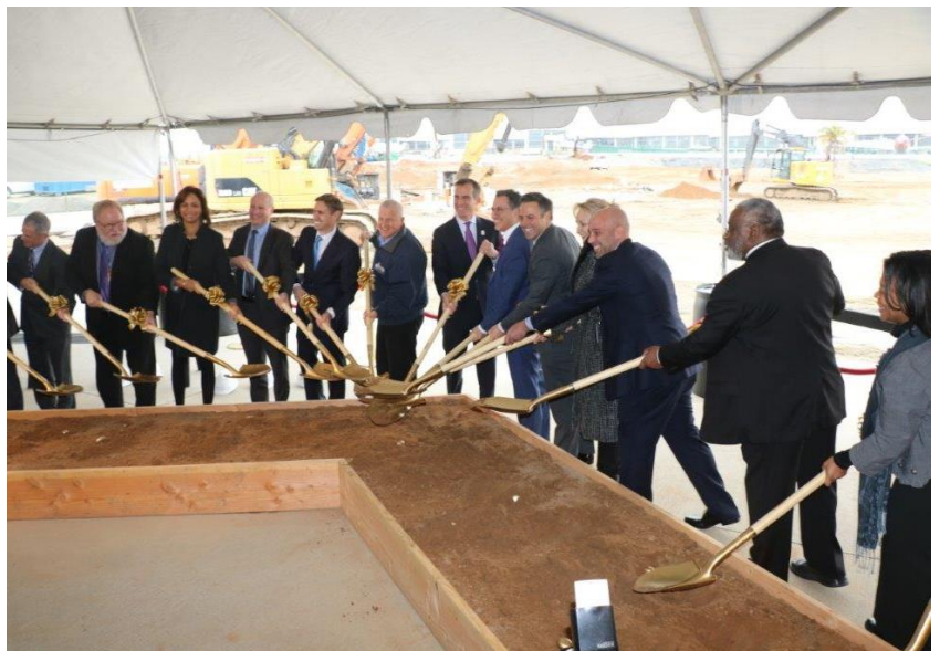
City and airport officials, including Mayor Eric Garcetti, center, marked the groundbreaking of the Midfield Satellite Concourse on February 27.

The groundbreaking for the new $1.6 billion Midfield Satellite Concourse (MSC) took place February 27, 2017, marking another milestone in the modernization of LAX. Los Angeles Mayor Eric Garcetti and airport officials, using gold shovels, broke ground on phase one of the MSC. The state-of-the-art, five-level facility and an associated new baggage system will provide the nation's second busiest airport with 12 new gates, a greatly enhanced guest experience, and additional flexibility to accommodate aircraft while other terminal upgrades at LAX are underway. The new construction is taking place on the airfield and will have minimal impact on passengers. Tunnel and Gateway building construction around the Tom Bradley International Terminal (TBIT) will be phased so that no more than two TBIT gates will be closed at any time.