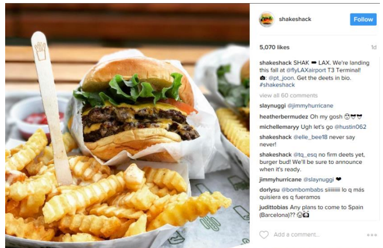
The news that Shake Shack is coming to Terminal 3 at LAX was warmly received on Instagram.